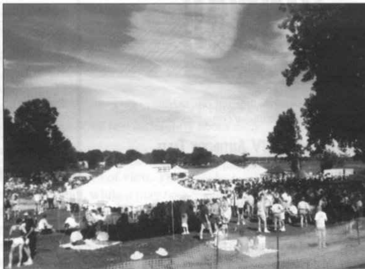
M.A.G.I.C. Picnic 1996, Brittingham Park, Madison This year: Sat. July 19, 1 p.m. - 7 p.m.

BiNet Midwest and BiNet USA newsletters and regular gatherings provide excellent opportunities for support, activist involvement and a sense of bisexual community. Membership is just $1 per each $1000 of income, which covers admission to both organizations. Send your membership donation along with - see BiNet , p.2