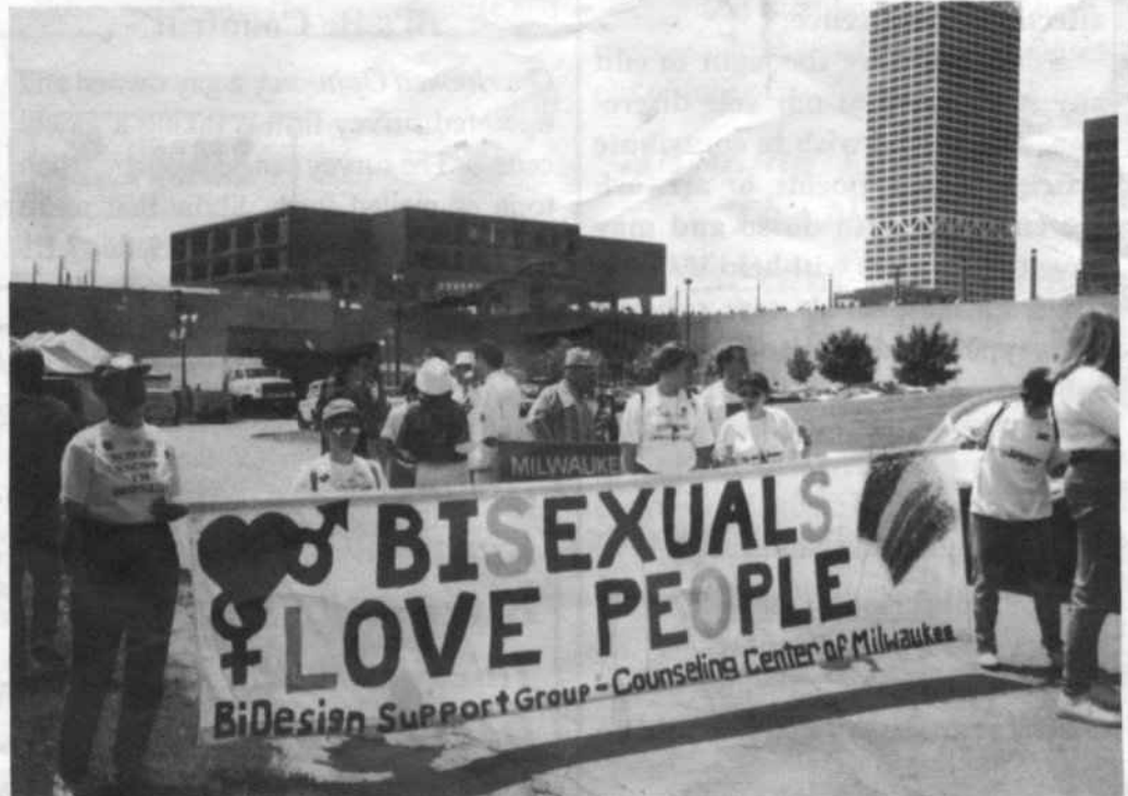
Members of BiDesign in the 1995 Pridefest Parade, Milwaukee, WI.