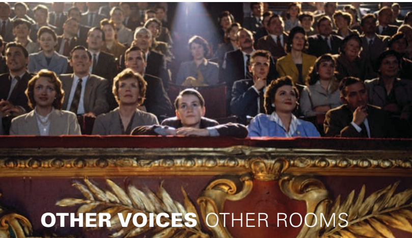
THE LONG DAY CLOSES