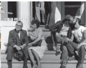
We Were Here: The AIDS Years In San Francisco