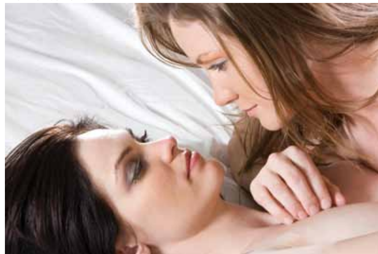
And Then Came Lola

AND AN AFTER-PARTY Co-sponsor Art Bar-Riverwest, 722 E. Burleigh St., welcomes you for an after party. Festive drink specials!