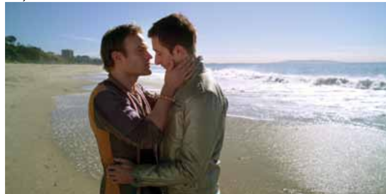
Hollywood Je T'Aime