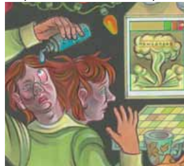
Every Time I See Your Picture I Cry