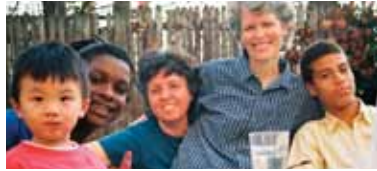
Off and Running