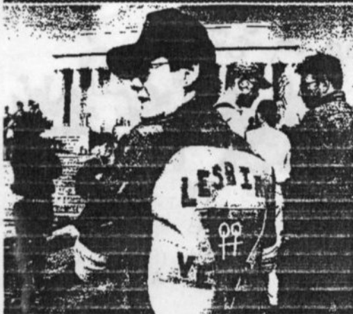
Speaking out at a Washington rally.