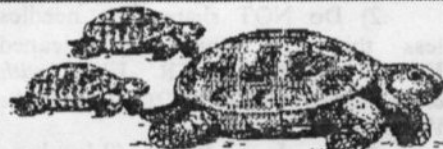
Social Progress - Slow but sure.