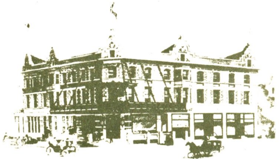
Madison's Hotel Washington as it looked at the time of its opening in 1905.

In the film, the Wisconsin Capitol will be standing in for the U.S. Capitol.