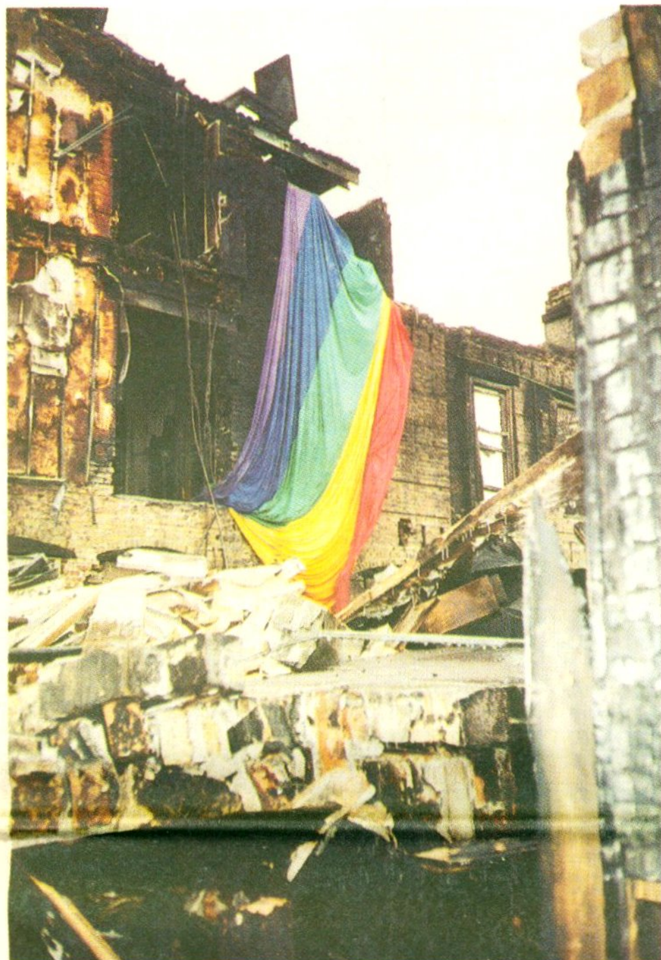
Over the Rainbow—Miraculously, a Rainbow Flag which once flew above the Hotel Washington, survived the devastating fire that destroyed the building on February 18 th .