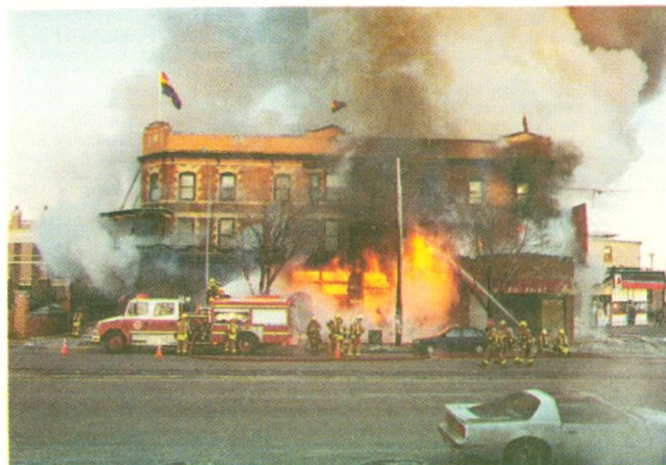
Landmark Levelled—Fire quickly raged out of control and engulfed the entire Hotel Washington on February 18 th .