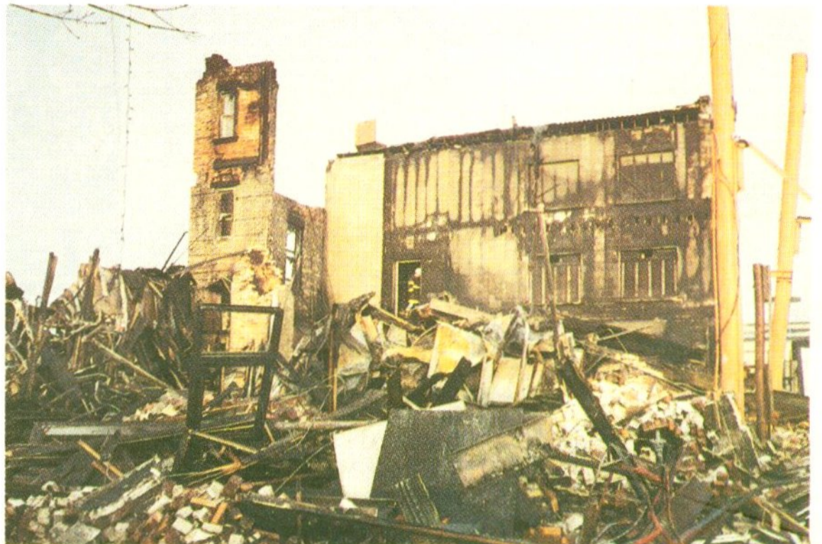
Historic Hotel in Ruins—Madison's Hotel Washington burned to the ground on February 18, 1996. Little more than ruins remained (above) as firemen worked to put out the last of the smoldering debris (below).