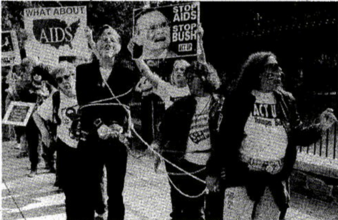
TIED IN A RED RIBBON— Over 5,000 people participated in "Hands Around the White House" in Washington, D.C. over the weekend to memorialize those who have died of AIDS. Holding a red ribbon that encircles the White House, the group which was often two deep filled the air with such chants as "Shame, Shame, Shame — Four More Weeks, Four More Weeks." and "We're Here, We're Queer and we Can Spell Potato." President Bush was shown being led by chains in this photo.