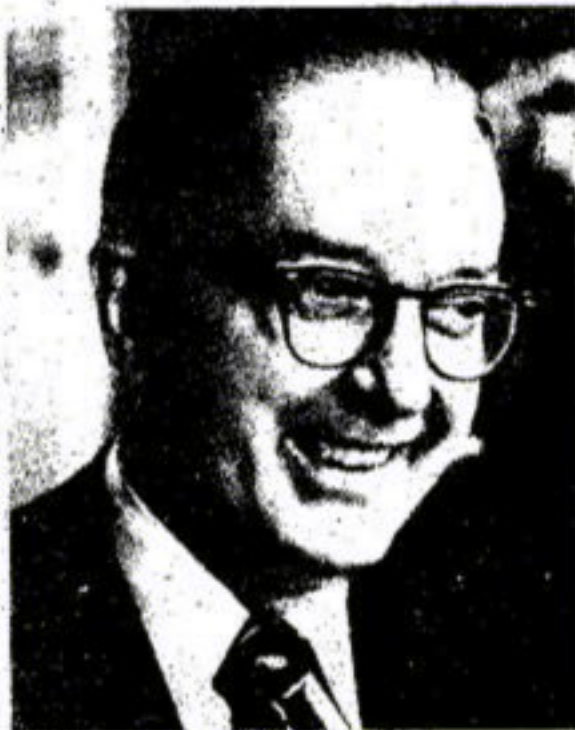
Senator Jesse Helms

So here they are folks; read 'em and jeer.