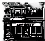
Clinton St. Antique Center

(Dear Serious: I wonder if your friend knows that some "alt wld" is trying to get in touch with him? Here's one for you to think about, every call that comes in to those lines is registered, in your case you'll probably get in the Pope's mailing list.)