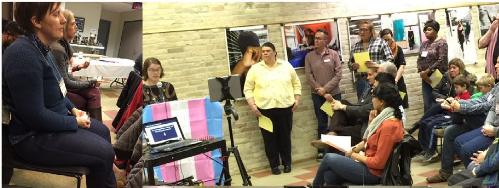
Trans day of remembrance