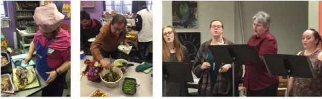
Thanksgiving Dinner at the LGBT Center, Milwaukee