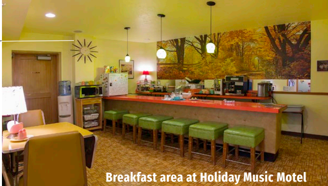
Breakfast area at Holiday Music Motel