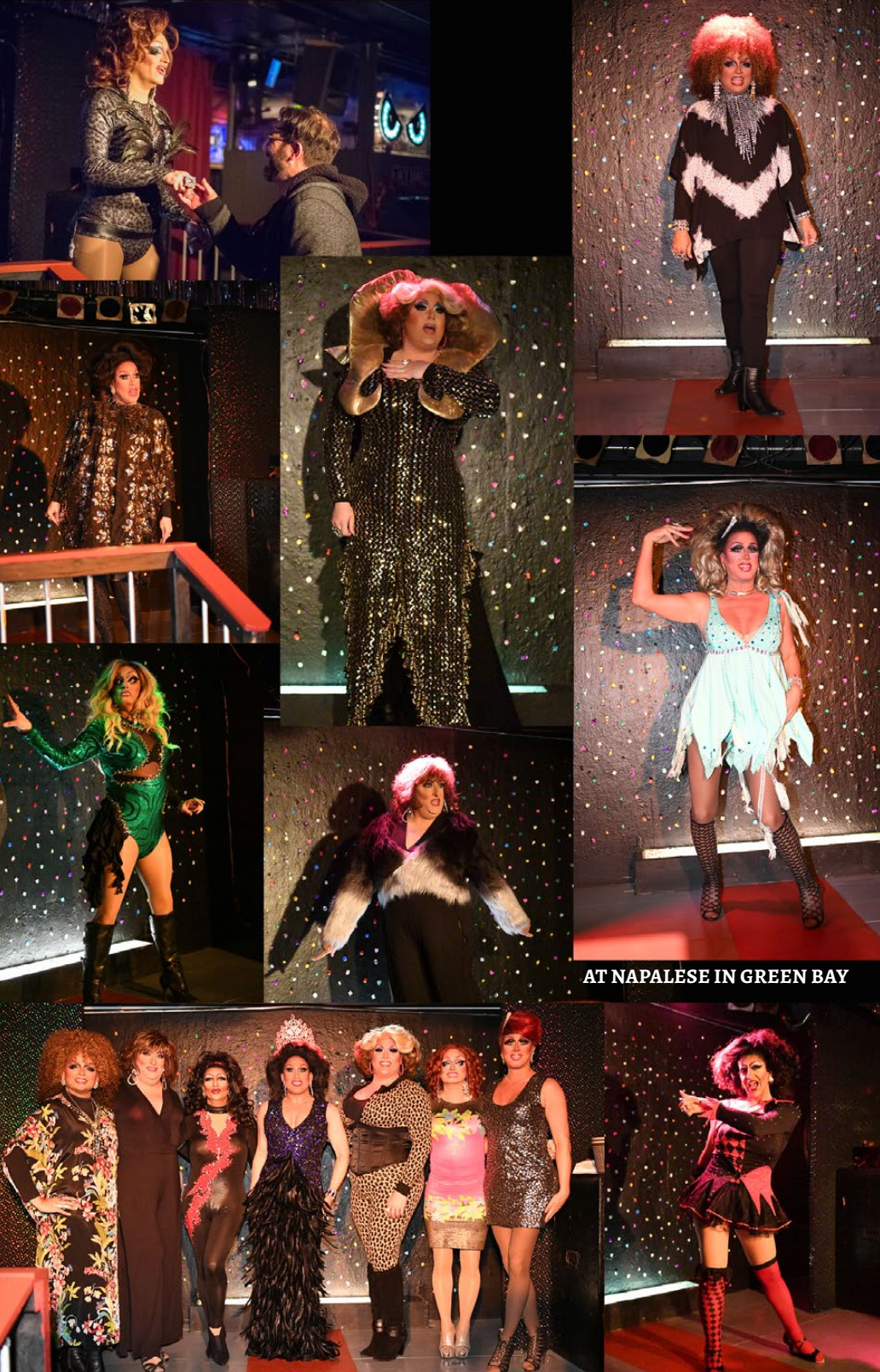
AT NAPALESE IN GREEN BAY

Quest's list of Wisconsin's foremost LGBT drinking institutions.