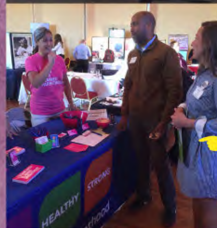
Wisconsin LGBT Chamber 3rd Annual Business Expo & Awards