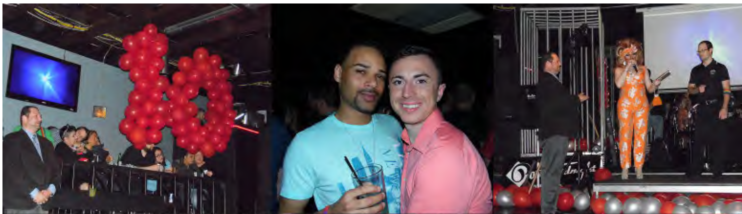
Club ICON Celebrates 10 Years!