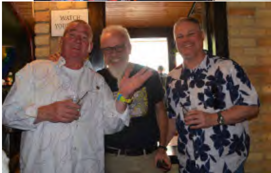
More from M&M Club Reunion Party