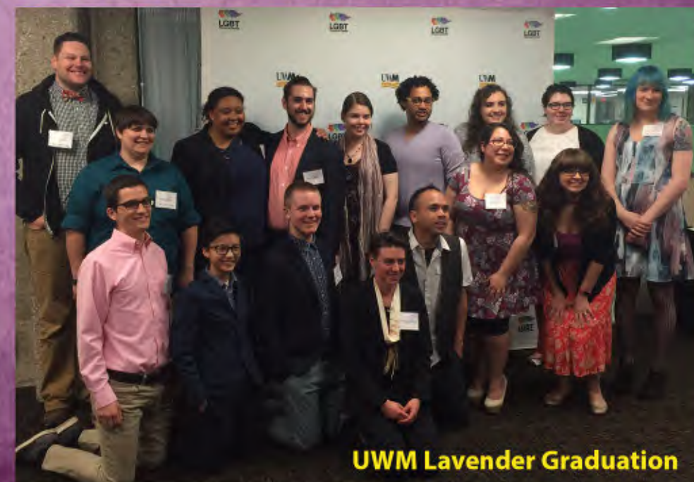
UWM Lavender Graduation