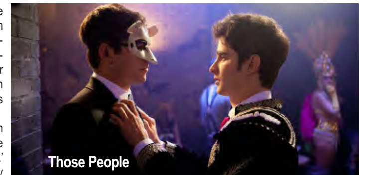
Those People When Tim begins to pressure Charlie for a commitment, particularly after he's offered a dream job with the San Francisco Symphony, poor Charlie is left in a quandary.

Providence brings Charlie and Tim together again and the two begin a torrid affair. Yet Charlie's unrequited infatuation for Sebastian remains unresolved.