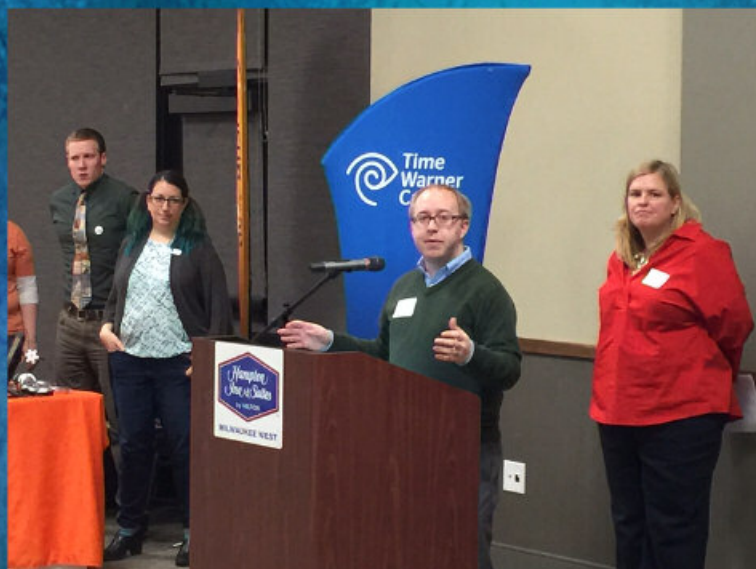
Below: LGBT Chamber's Give Back Night