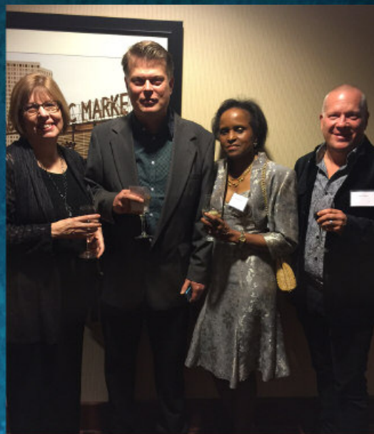
Above and Left: Fair Wisconsin Awards Dinner