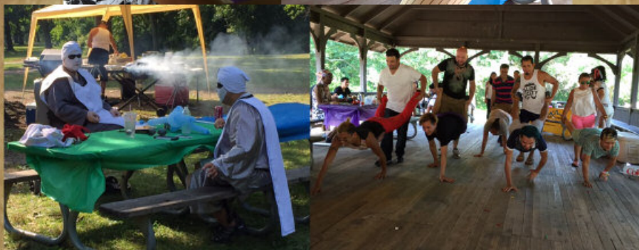
16th St Community Health Center Picnic at Jackson Park