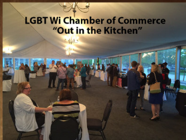
LGBT Wi Chamber of Commerce "Out in the Kitchen"