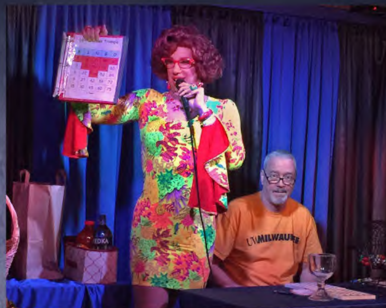
HAMBINGO FUNDRAISER at Hamburger Mary's for LGBT UWM alumni board student scholarship fund