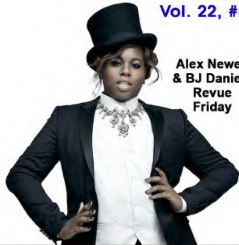
Alex Newell & BJ Daniels Revue Friday