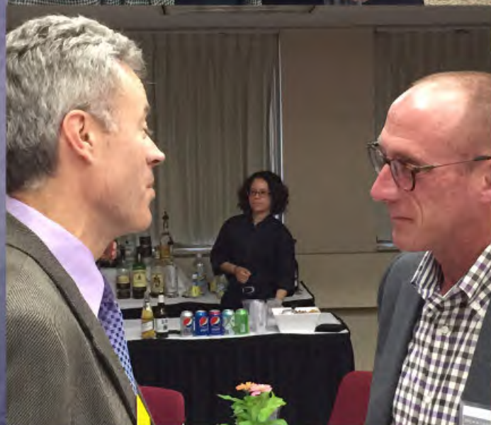
ARCW At 30 /UWM archives event