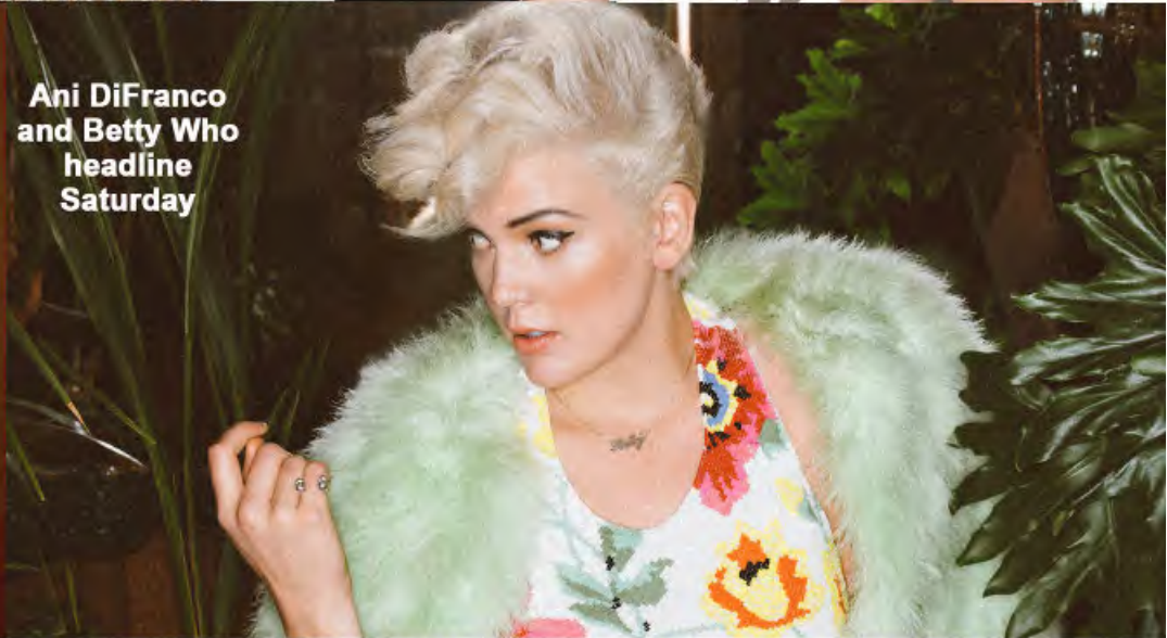
Ani DiFranco and Betty Who headline Saturday

NATIONAL HEADLINERS • YOUR FAVORITE QUEENS FAMOUS DJS & SO MUCH MORE! CHECK OUT THE PULL-OUT SCHEDULE IN THE CENTER OF THIS ISSUE!