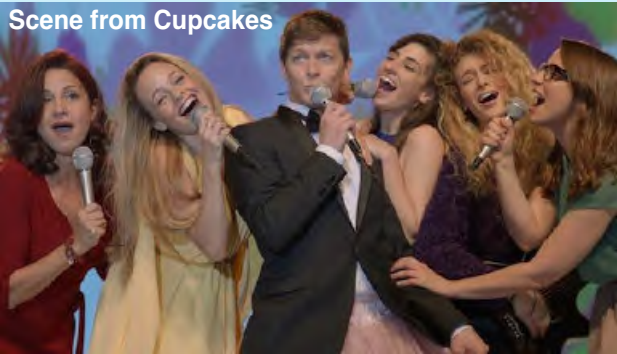
Scene from Cupcakes

Will Ofer manage to convince his friends, not to mention his closeted boyfriend, to take a chance? First, each must break out of their respective shells and later, they will have to band together and rebel against allowing the so-called professionals who want to transform the Anat-Ofah into yet another standard issue, run of the mill pop-group, ridding "It'll All Work Out" of the charm and simple joy that made it so special in the first place.