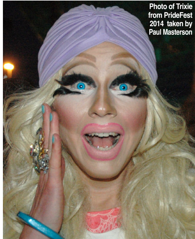
Photo of Trixie from PrideFest 2014

Trixie has the talent, the poise and the personality to be the next Drag Super Star. Con-Drag-ulations and Best of Luck, Trixie!