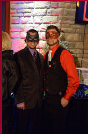
GLBT Partnership (Harmony Cafe) Hosted Unmasque at the Marq Use the Qcode to see them all online