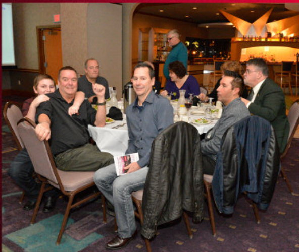
Fall Fundraising for the LGBT community in the Fox Valley and Green Bay