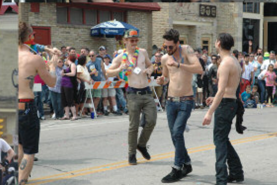
Milwaukee LGBT Pride Parade