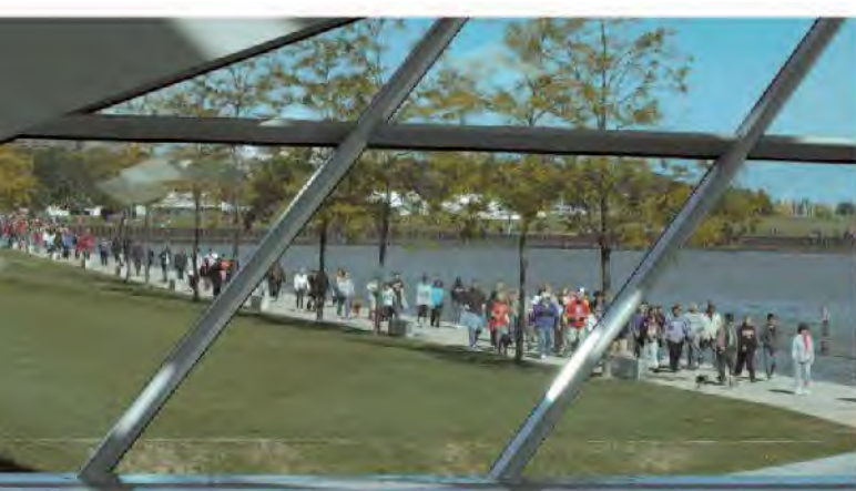
AIDS Walk