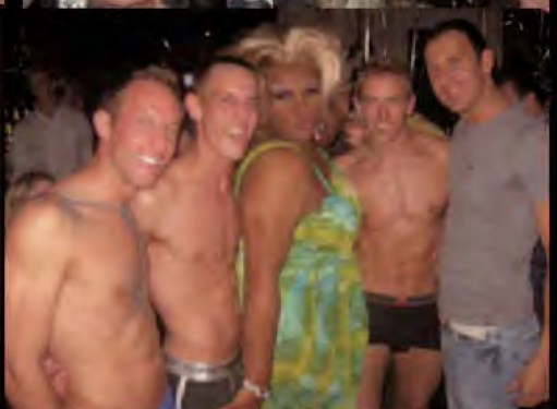
PLAN B, MADISON ANNIVERSARY PARTY