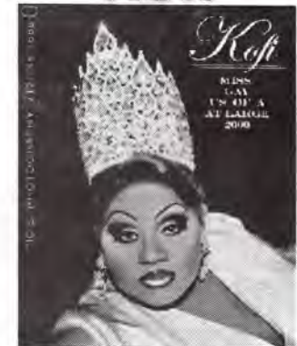
Miss Gay USofA At Large 2000