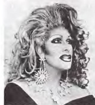
Miss Gay America 2002