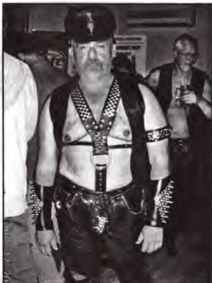
MR HARBOR ROOM 2006