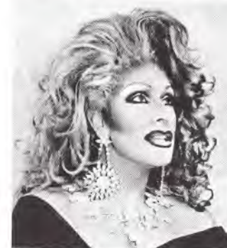
Miss Gay America 2002