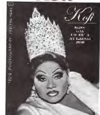
Miss Gay USofA At Large 2000