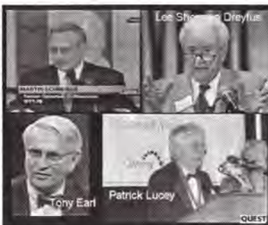
Badgers in this state?"