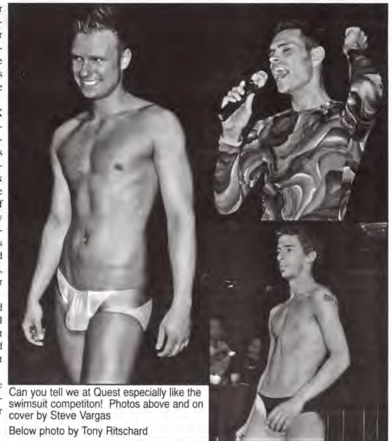
Can you tell we at Quest especially like the swimsuit competition!