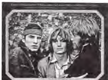
andy warhol's lonesome cowboys

According to Bogner, Warhol's film was originally intended as a Western version of "Romeo and Juliet," and adopts cowboy drag and wears only the merest trappings of plot. "Nominally the clash between settled folk and a rootless band of horsebacked 'brothers' just passing through, the film offers a barely corralled paddock of jokiness, flippantly held poses, and unchecked behavior," he said. "The milieu's attendant homo-sociality allows a revue of masculinities considered and a stable full of varieties of male