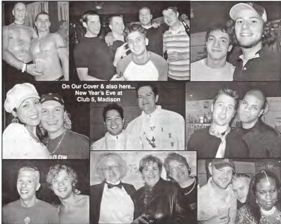
On Our Cover & also here... New Year's Eve at Club 5, Madison

The study concluded that LGBT adults have greater experience and resources and are more familiar with the historical roots of the LGBT movement. But the challenge, the researchers noted, is to create intergenerational contact. Among their suggestions was the creation of youth panels that feature positive "coming out" stories.