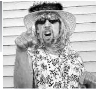
Giving a good tongue lashing to the religious right.

Oh, I am going to have fun with you! Let me start off by saying that not all Christians think the way you do. There is a huge difference between a fundamentalist Christian and a loving person who actually practices the non-judgmental teachings of Jesus. Although I believe in freedom of speech and respect you as a human being, I would like to give your shitty attitude a bitch-slap of a colossal magnitude. You have major control issues. You're trying to control womyn, gays/lesbians/bisexuals, and all of society, for that matter. (Ya know...you would make a good dictator. Have you thought about moving to the Middle East?