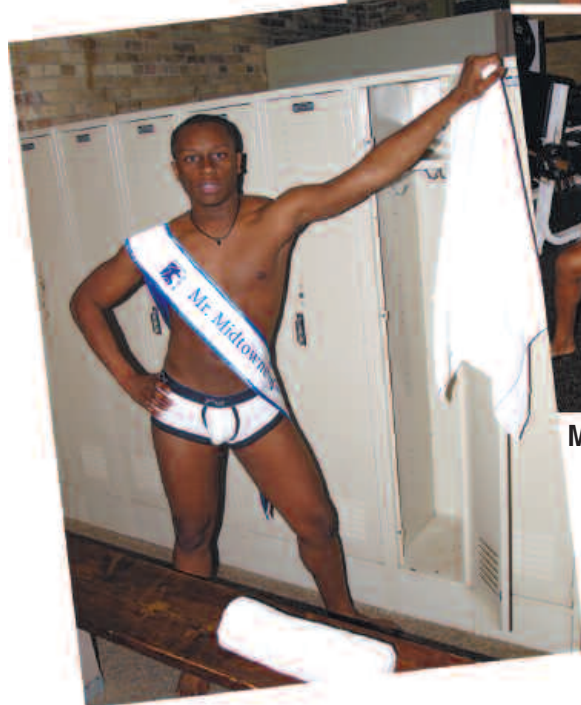
Mr. Midtowne Spa held at Boom & The ROOM