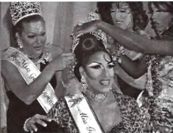
Beja is crowned the winner!