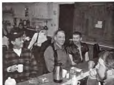
Argonauts of Wisconsin @ Napalese