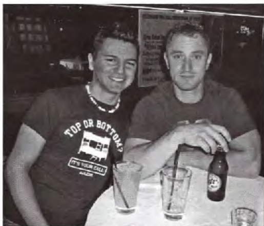
Miss Great Lakes USofA returned to Wisconsin and was held at LaCage