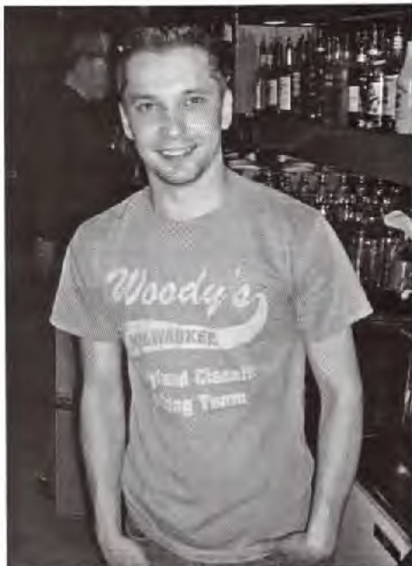
SuperBowl at Woody's