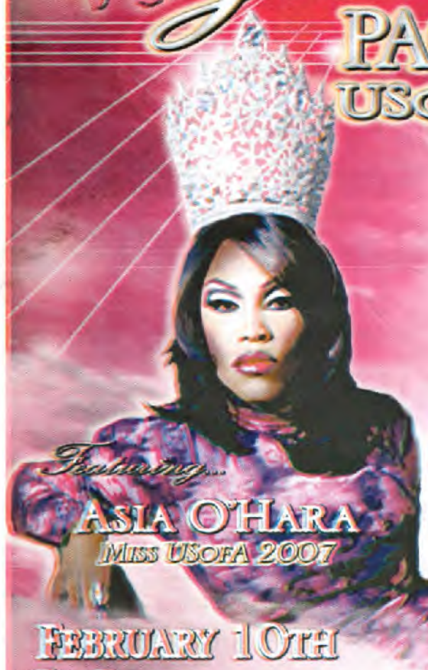
Featuring... ASIA O'HARA Miss USOFA 2007