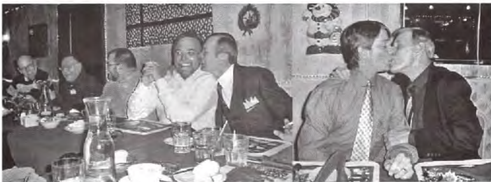
Left: Harbor Room Christmas Party for Staff & Customers