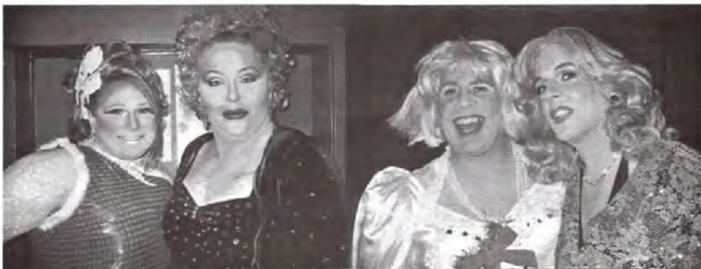
Below: Club 5's Simply Divine Xmas show