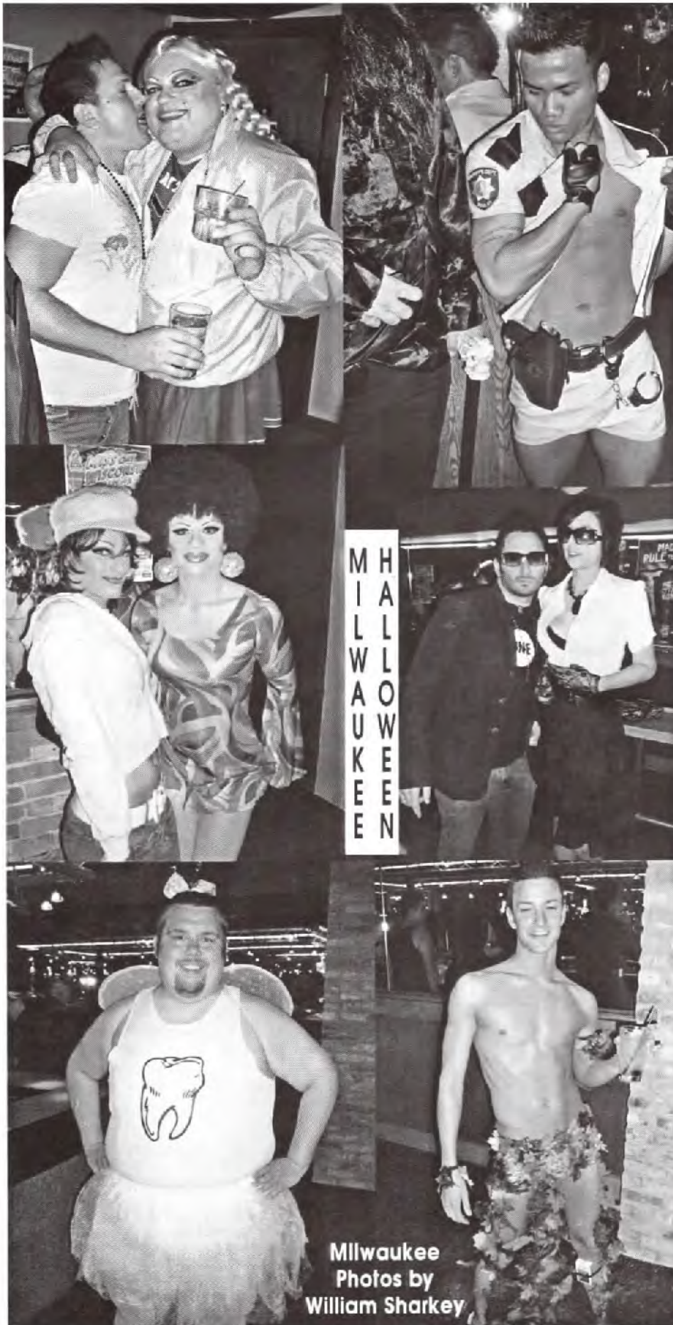
Milwaukee