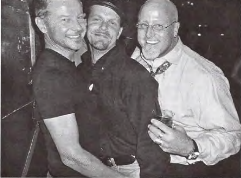
Above: M's Anniversary Party Below: Miss Wisconsin Continental Plus at LaCage