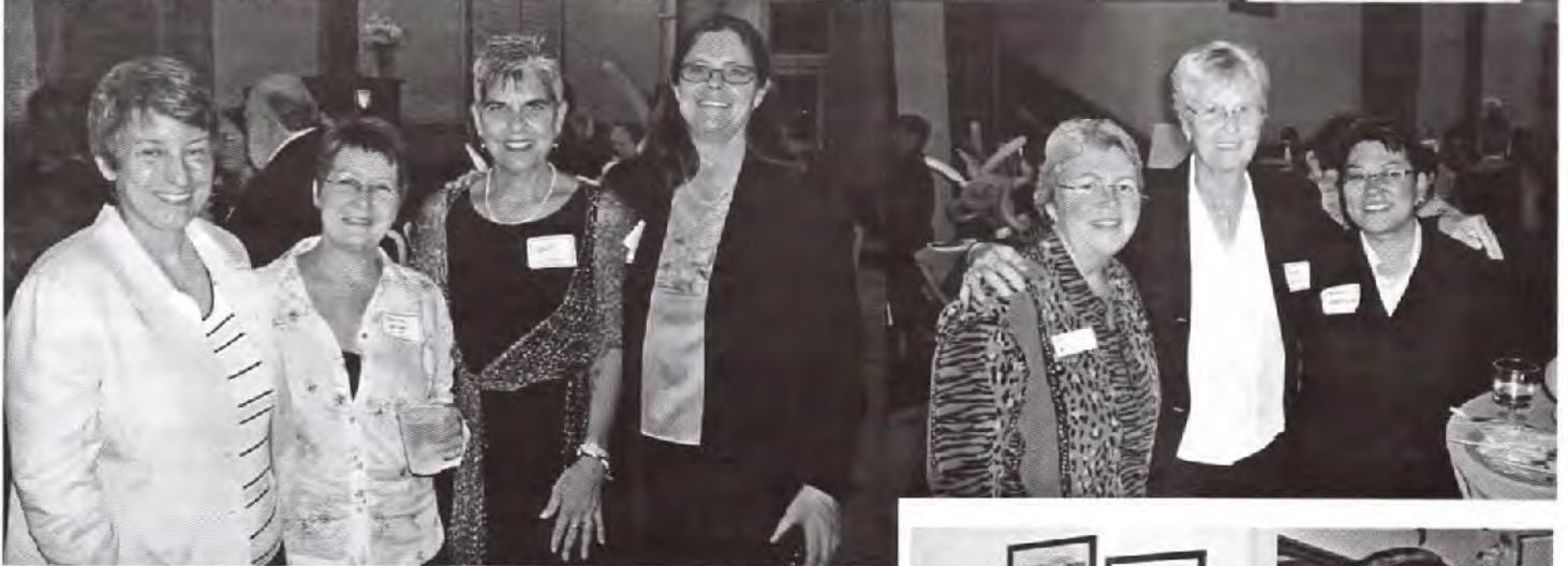
Above: Cream City Gala Celebration Below: Leather Show at Milwaukee Gay Arts Center