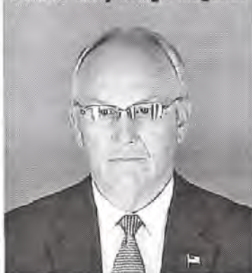
Senator Larry Craig's Mugshot