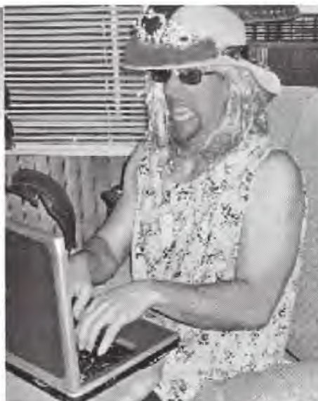
Uncle Barbie: offering a glimmer of acceptance to those barely tolerated.

It's Waterloo. Last night at the group home, we watched some reality TV with my close friends. I think these reality shows are like traveling down a paved road; of course it has potholes, but it also has more. But no problem, I don't mind. Believe it or not, I kind of like it. I'm permitted outside. I can be found at the park where I read your column over and over again; I'm still loose though. Sometimes, I feel that I want to, but then, I don't. Again Uncle Barbie remodeled my psyche (which is a cousin to my brain). After Saturday, my family took me out for a bite; it's worth it though. I'm getting some cool stuff out of them, huh? Looking back, I lucked out--I got a permanent welfare account! I thought about it and went back to where I met up with another friend (which makes it a good day). Yeah baby! A couple times it was possible to go all the way with my friend, but it didn't happen. What an interesting life I have. Haven't had anything to eat and a few times I wished a belated birthday so many times just for cake. Speaking of food, I can smell what the staff is cooking for dinner tonight...mmmm. Gotta go! Signed, Waterloo