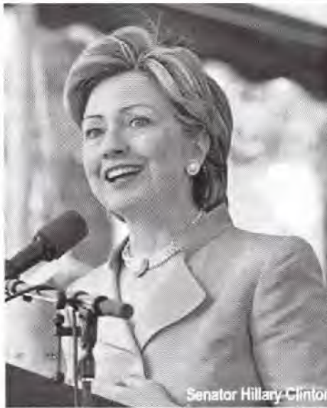
Senator Hillary Clinton

Baldwin was elected to the House of Representatives in 1998, becoming the first woman to represent Wisconsin in Congress. She is a forceful advocate for creating a universal healthcare system for all Americans, and has worked to expand stem cell research and prescription drug benefits for seniors.