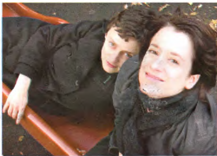
Tick Tock Lullaby Sunday, September 16, 5pm

One of the community's longest running film festivals celebrates its 20th anniversary with an international array of the finest and newest in films and videos by and about the lesbian, gay, bisexual, and transgender communities.