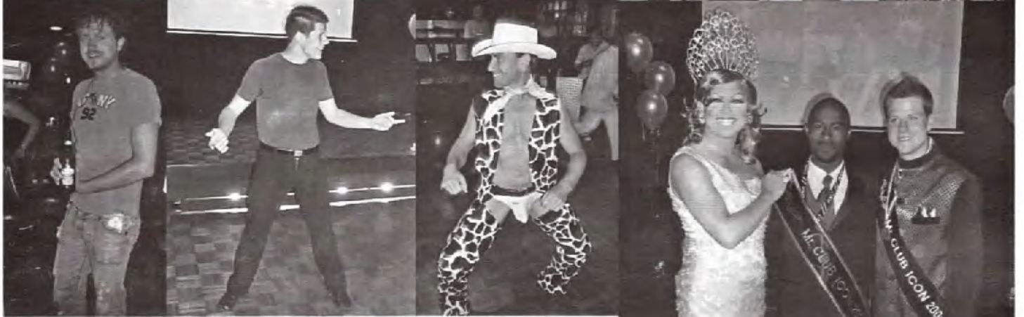
Above and Right: Mr. Club ICON at ICON, Kenosha Below: Karaoke on thursdays at Switch, Milwaukee