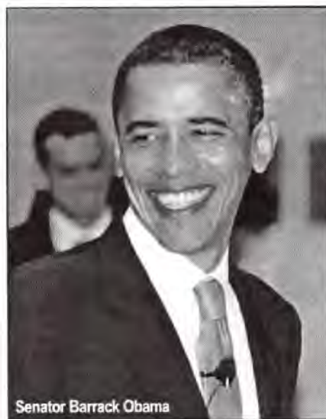
Senator Barack Obama

Robinson said he hopes to persuade Obama to embrace marriage for gay and lesbian couples. Obama supports civil unions and rights for gay couples, but stops short of supporting gay marriage. Robinson, a registered independent and opponent of the war in Iraq, said he was drawn to