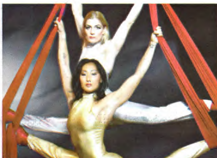
The Gymnast Friday, September 14, 7pm