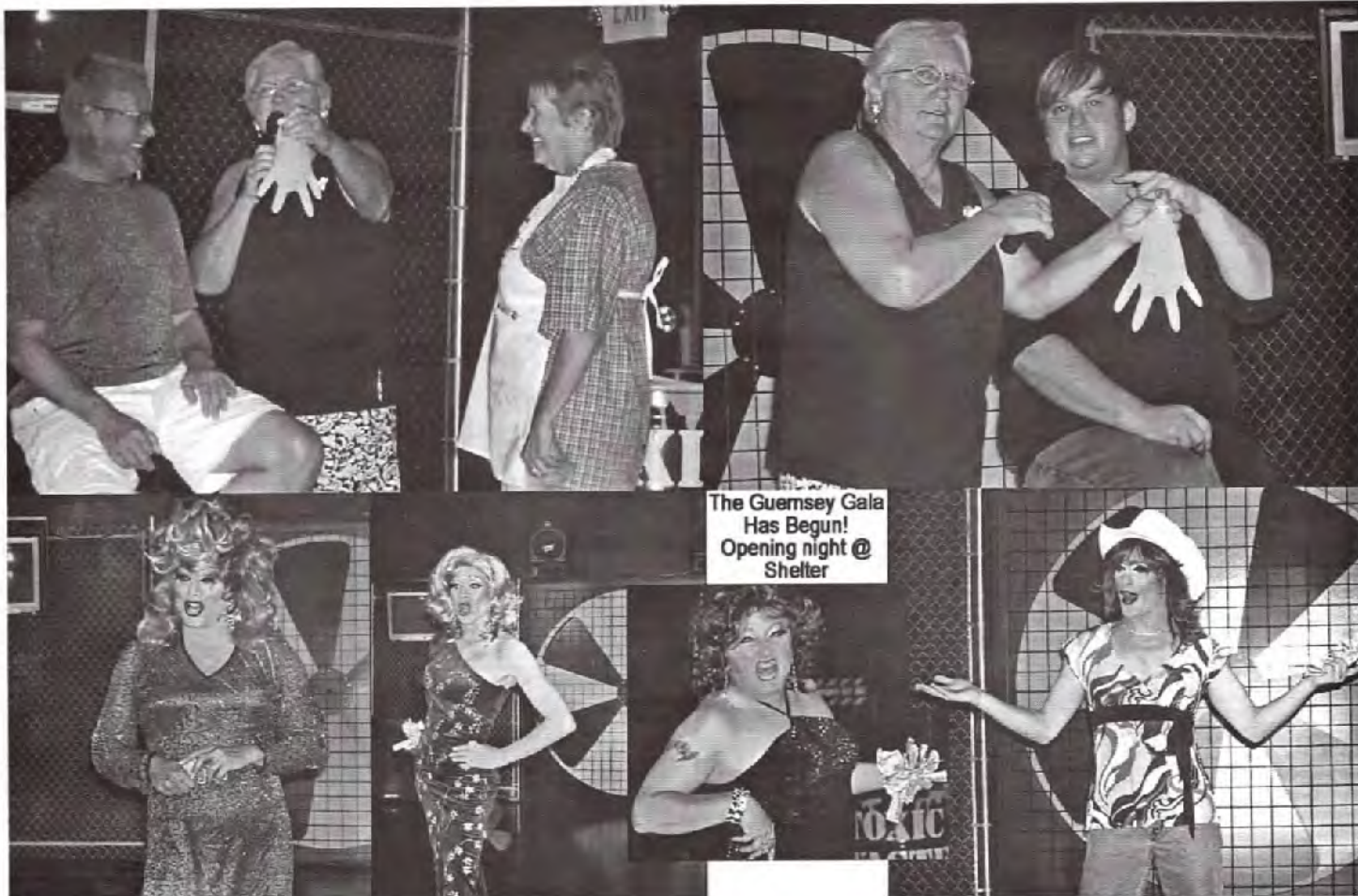
The Guernsey Gala Has Begun! Opening night @ Shelter