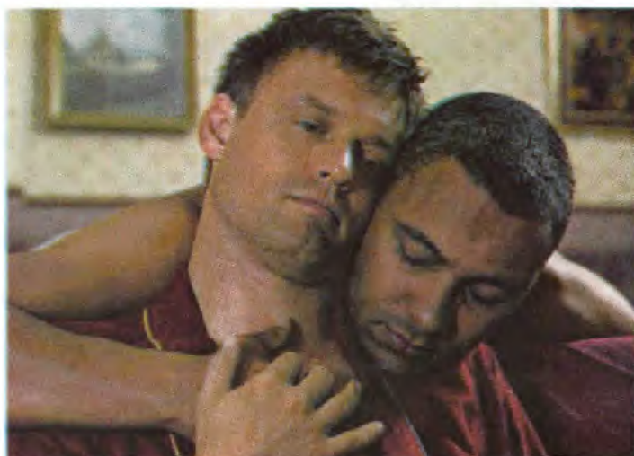
Oh Happy Day Friday, September 7, 5pm