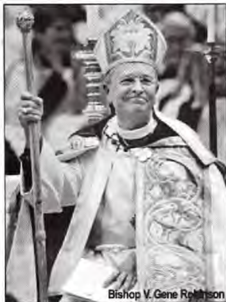
Bishop V. Gene Robinson

Wisconsin companies with inclusive nondiscrimination provisions include Miller Brewing, SC Johnson, and Foley and Lardner.