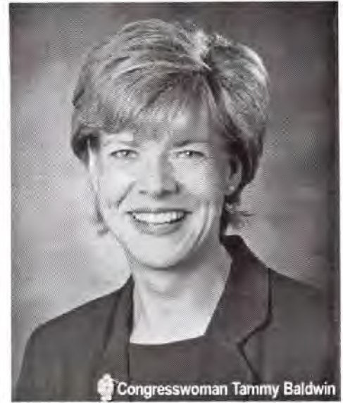
Congresswoman Tammy Baldwin

Baldwin sees Wisconsin as a critical part of the Clinton strategy to win the nomination. "The upper Midwest tends to have very high voter participation, and I always run campaigns that really