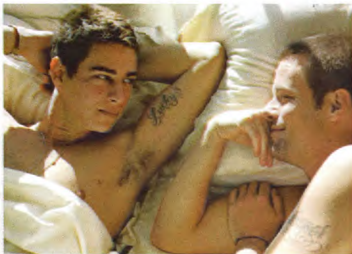
Shelter Friday, September 7, 9pm