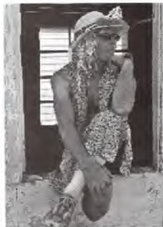
Providing the missing pieces in the big jigsaw puzzle of life.

to you intentionally. Believe me, there is no Universal conspiracy out there plotting against you. (Well, okay, maybe there is...) Perhaps it's just your charming personality that people find irresistible. It could be that you have the type of charismatic attraction that is found only in great leaders of nations. (Nah, I think movie goers are just out to get you.) Either that or you have a tremendously bright aura that draws the public to you like a moth to a flame. By the way, what kind of cologne do you use? Oh, never mind. You don't need to worry. I'm sure people just sit in front of you in the theater because they are too unaware of their surroundings to notice you, and too self absorbed to care. (No, but seriously though, they really are out to get you!!!) -- Playing Mind Games, Barbie