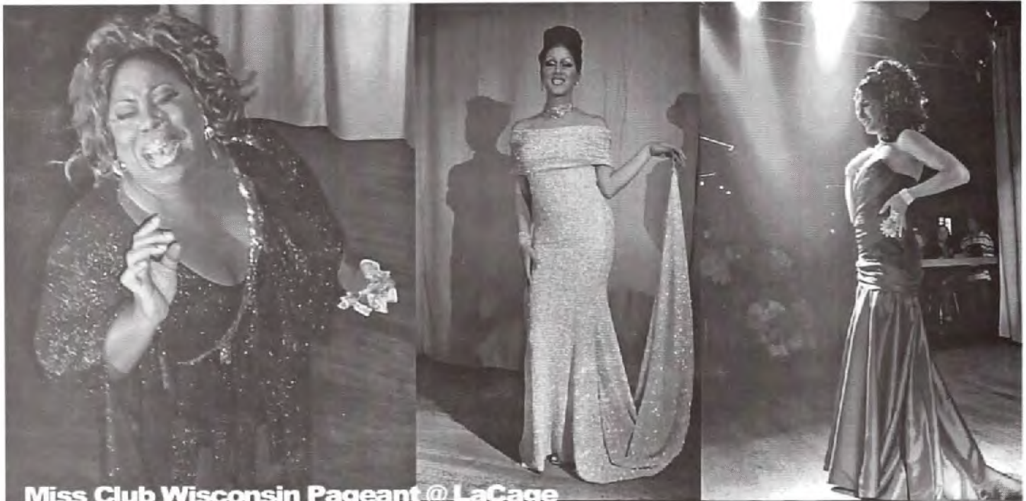
Miss Club Wisconsin Pageant @ LaCage