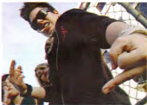
Itty Bitty Titty Committee

Centerspiece Film - Wednesday, September 12, 7:30pm Oriental Theatre