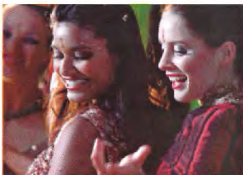
Nina's Heavenly Delights

Opening Night - Thursday, September 6, 7:30pm Oriental Theatre