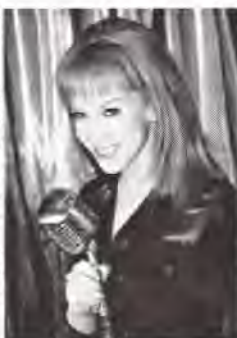
Kathy Griffin & Cascada

Cascada burst onto the pop music scene in 2006 with one of the biggest songs of the year, "Everytime We Touch." The song was just certified platinum (1,000,000 sales), the first modern dance track to achieve that honor. Cascada's newest single, a cover of Savage Garden's "Truly Madly Deeply," is rising fast on new