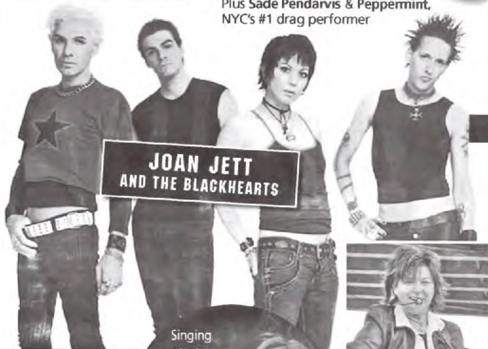
JOAN JETT AND THE BLACKHEARTS

Support PrideFest , Wisconsin's largest LGBT celebration. Join the 2007 Proud Crowd today at www.pridefest.com