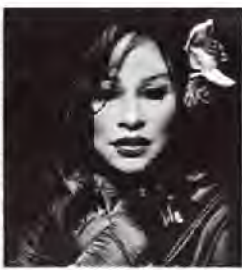
Chaka Khan & Joan Jet

More information is available at www.pridefest.com .