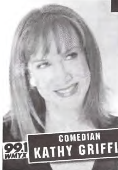
COMEDIAN KATHY GRIFFIN