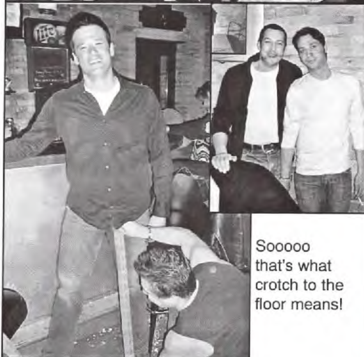
Sooooo that's what crotch to the floor means!