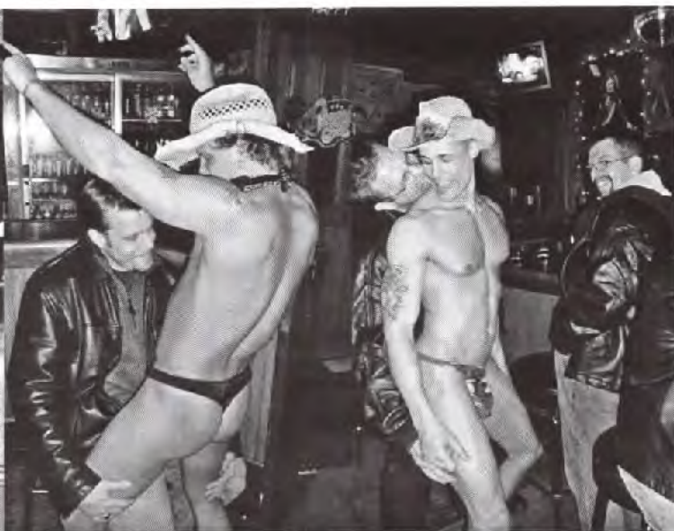
Our cover model this issue is one of the entertainers who dance at Switch on Friday nights. Switch will add dancers on Sunday soon.