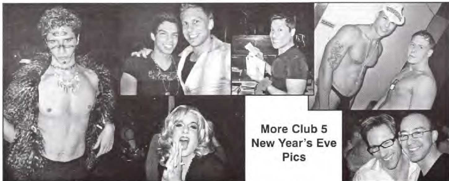
More Club 5 New Year's Eve Pics