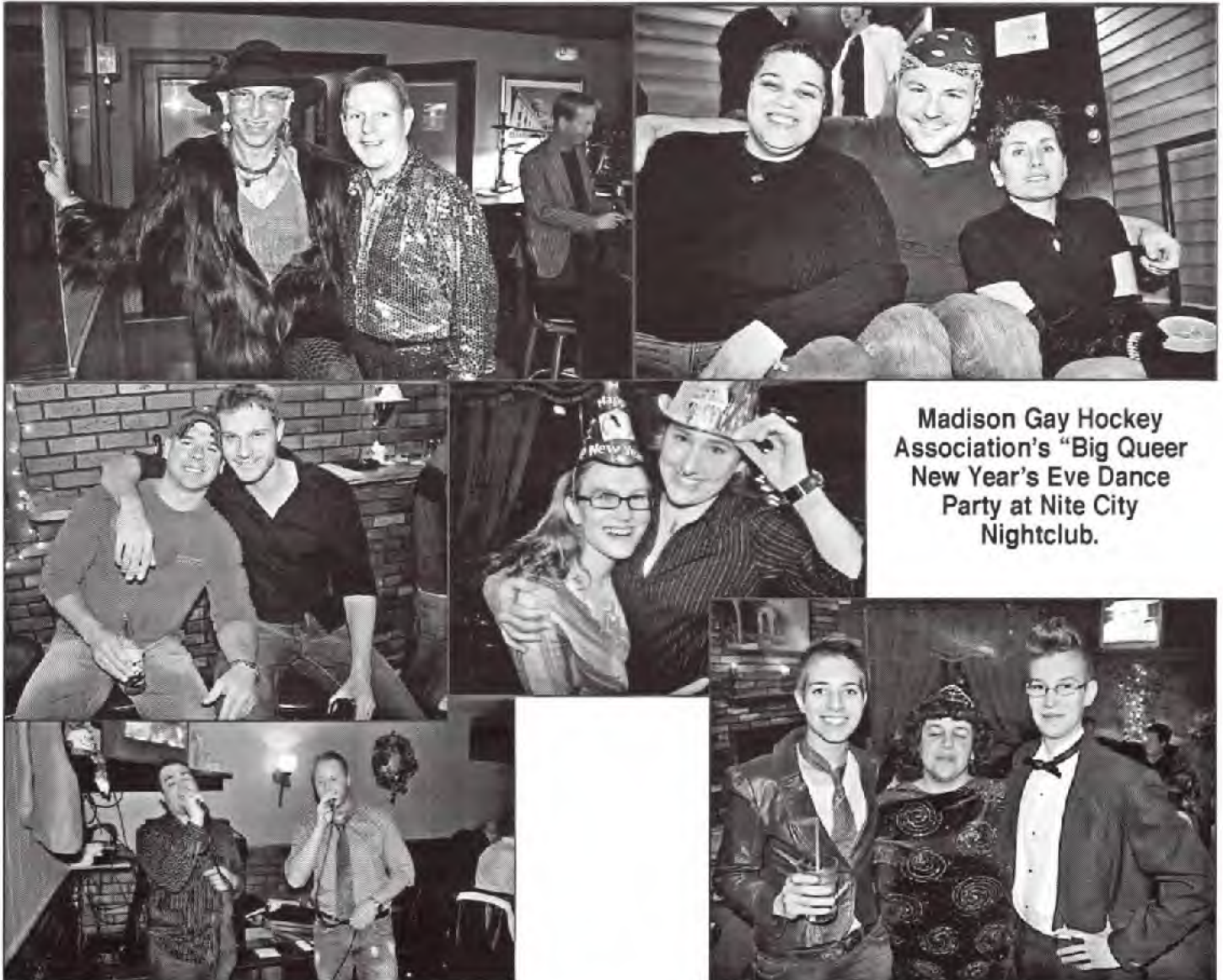
Madison Gay Hockey Association's "Big Queer New Year's Eve Dance Party at Nite City Nightclub."