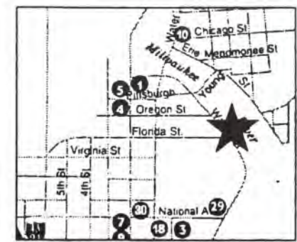
A Private Men's Health & Recreation Facility

Check out Midtowne Spa when you visit Milwaukee