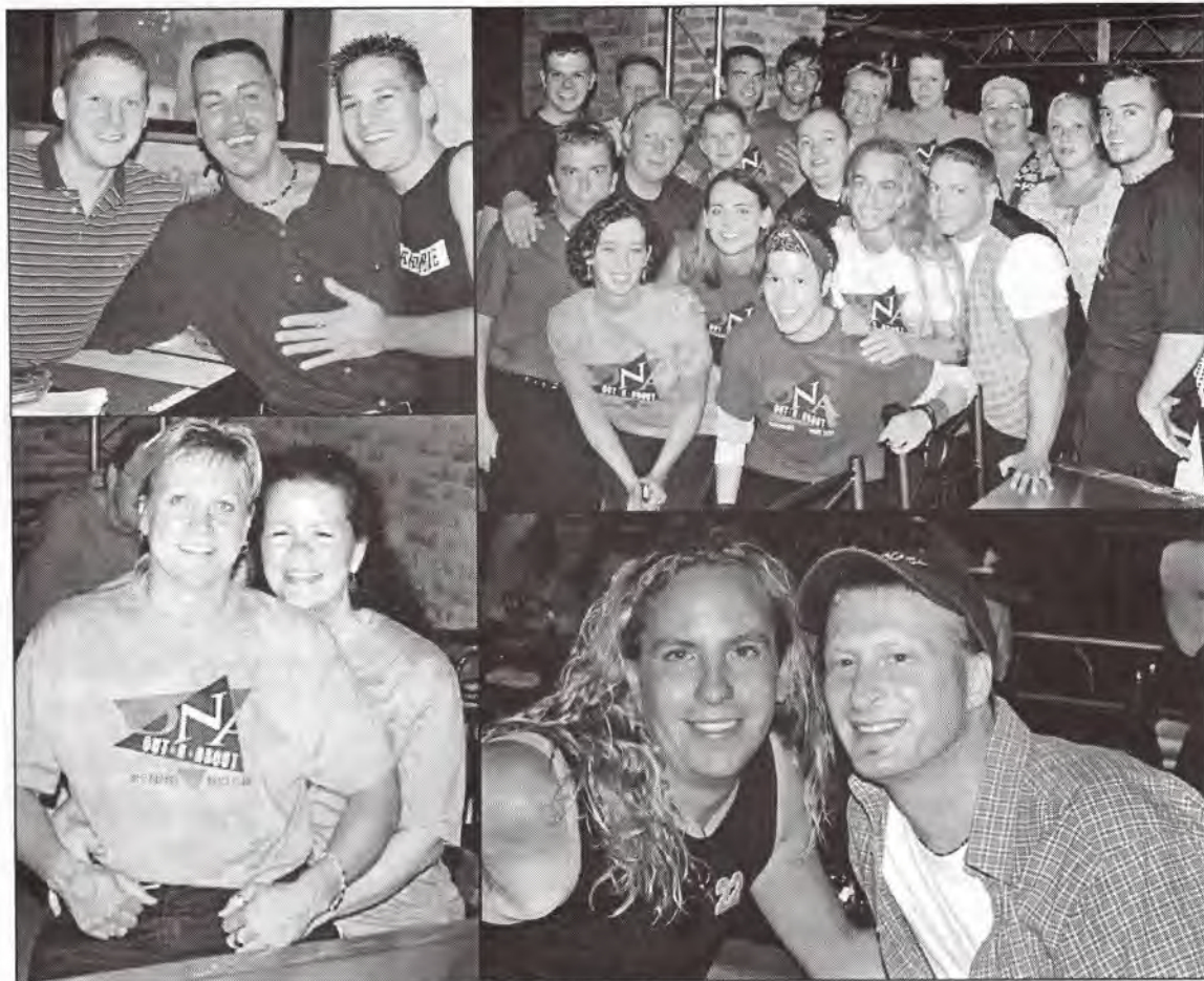
ONA get together