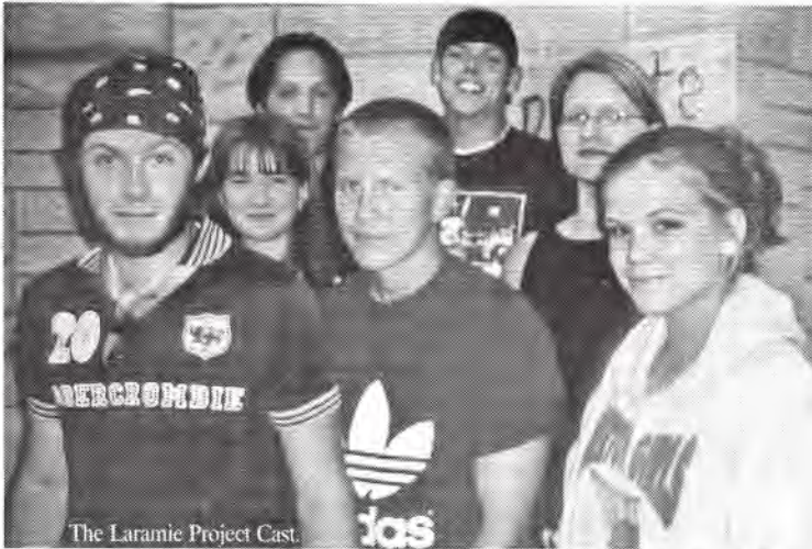
The Laramie Project Cast.

Shepard's death - savagely beaten and left to die was an act of brutality and hate which shocked the nation, and became a national symbol of intolerance, but for the people of Laramie, Wyoming, it was deeply personal and it is their voices we hear in this stunningly effective theater piece.