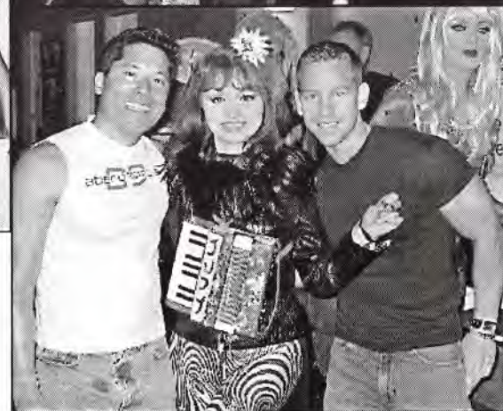
Pridefest