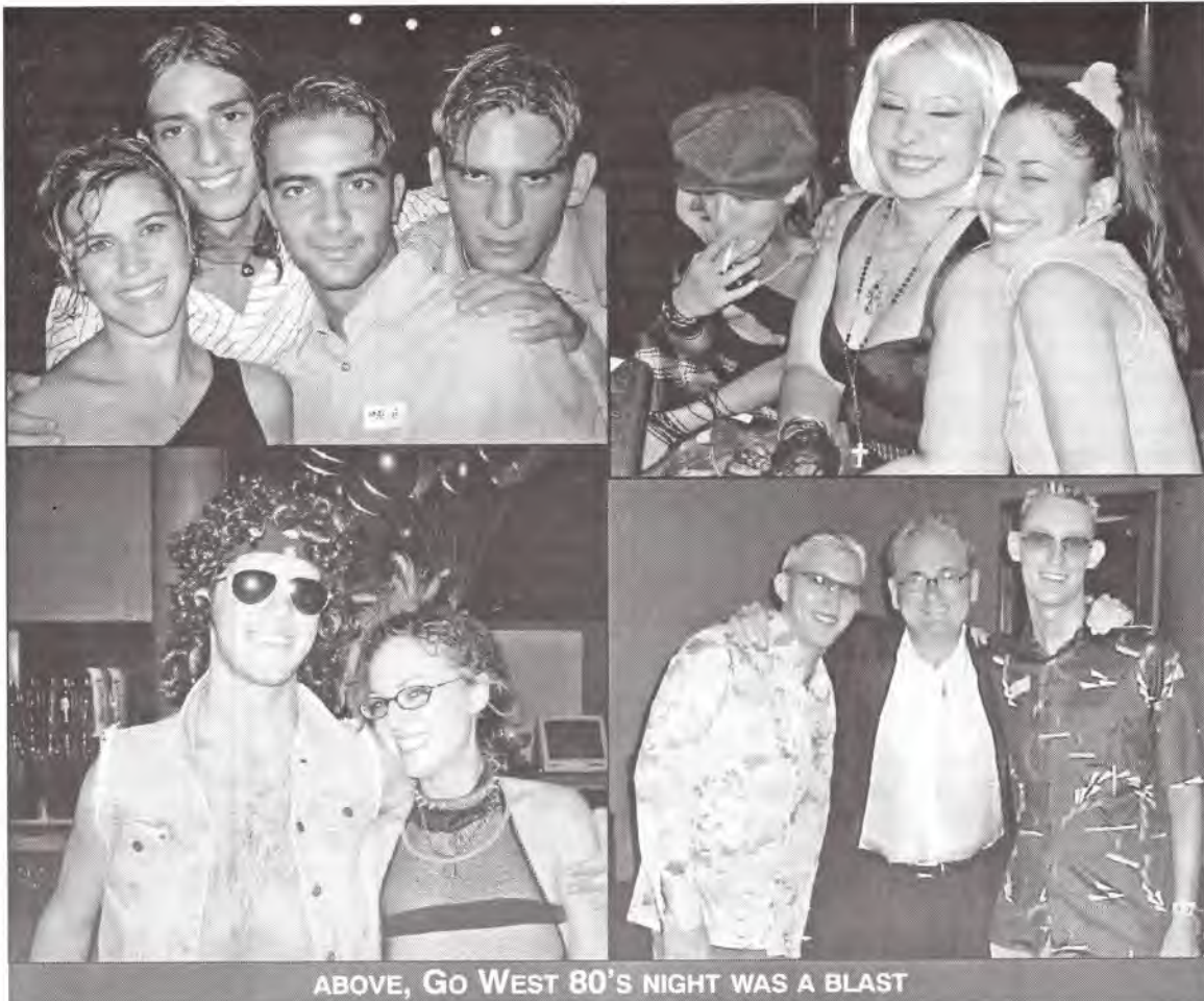
ABOVE, GO WEST 80'S NIGHT WAS A BLAST