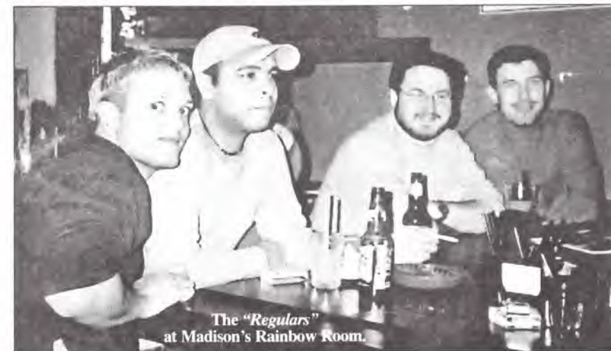
The "Regulars" at Madison's Rainbow Room.