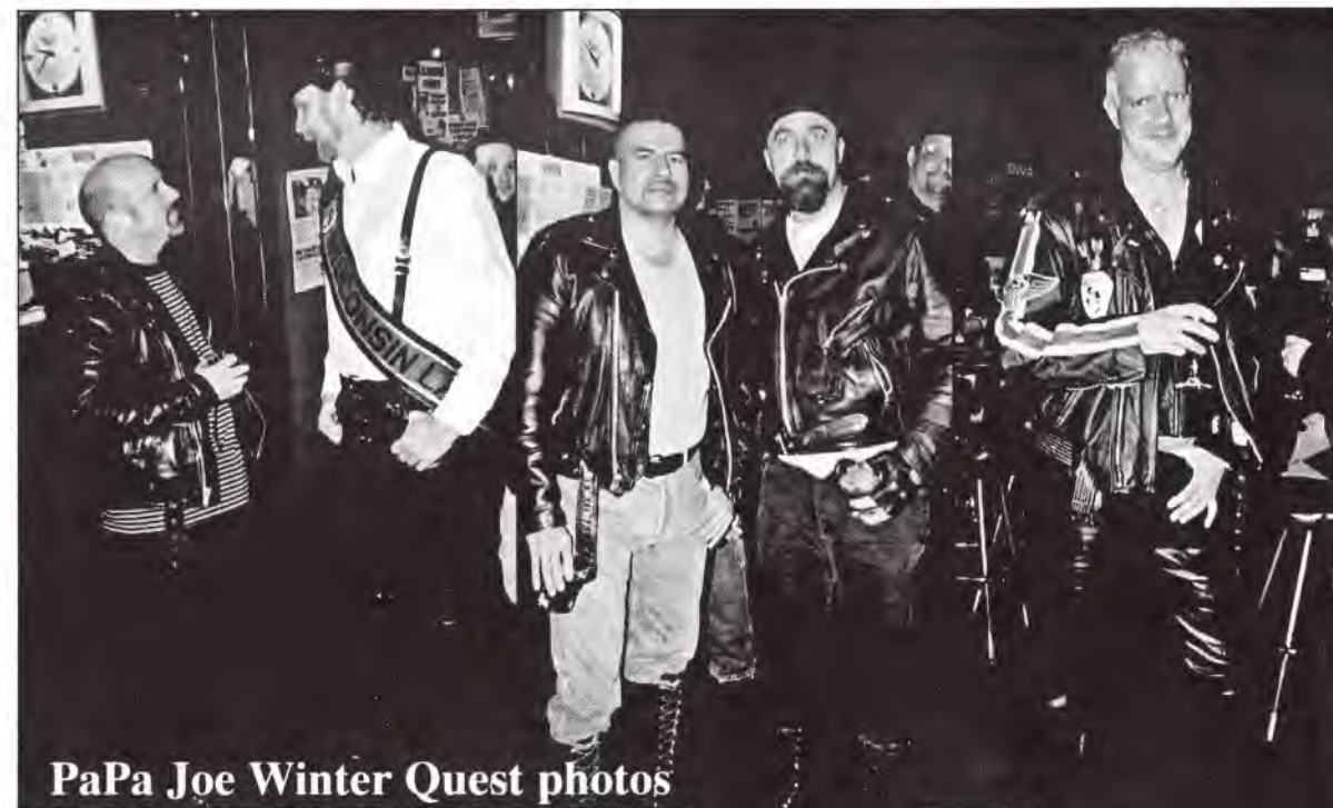
PaPa Joe Winter Quest photos