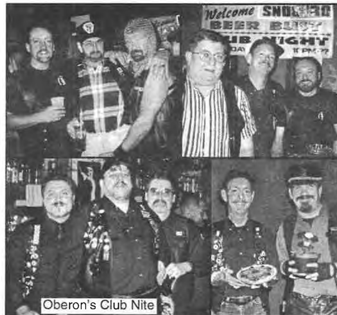
Oberon's Club Nite