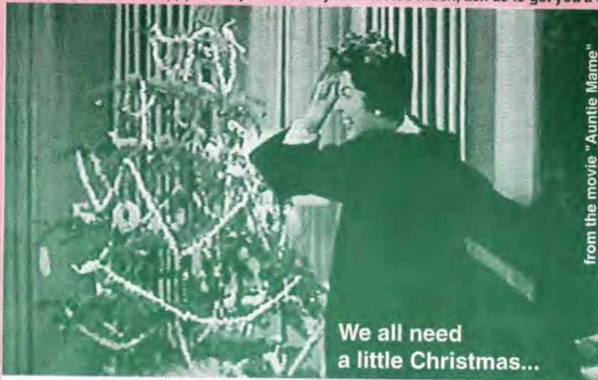
from the movie "Auntie Mame"

Please have a safe and happy holiday season. If you drink too much, ask us to get you a taxi!