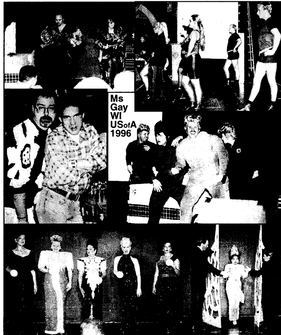
Ms Gay WI USofA 1996