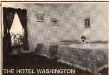
THE HOTEL WASHINGTON

Quest may lawfully publish & cause such publication to be made save blameless Quest from any & all liability, loss & expense of any nature arising from such publication.