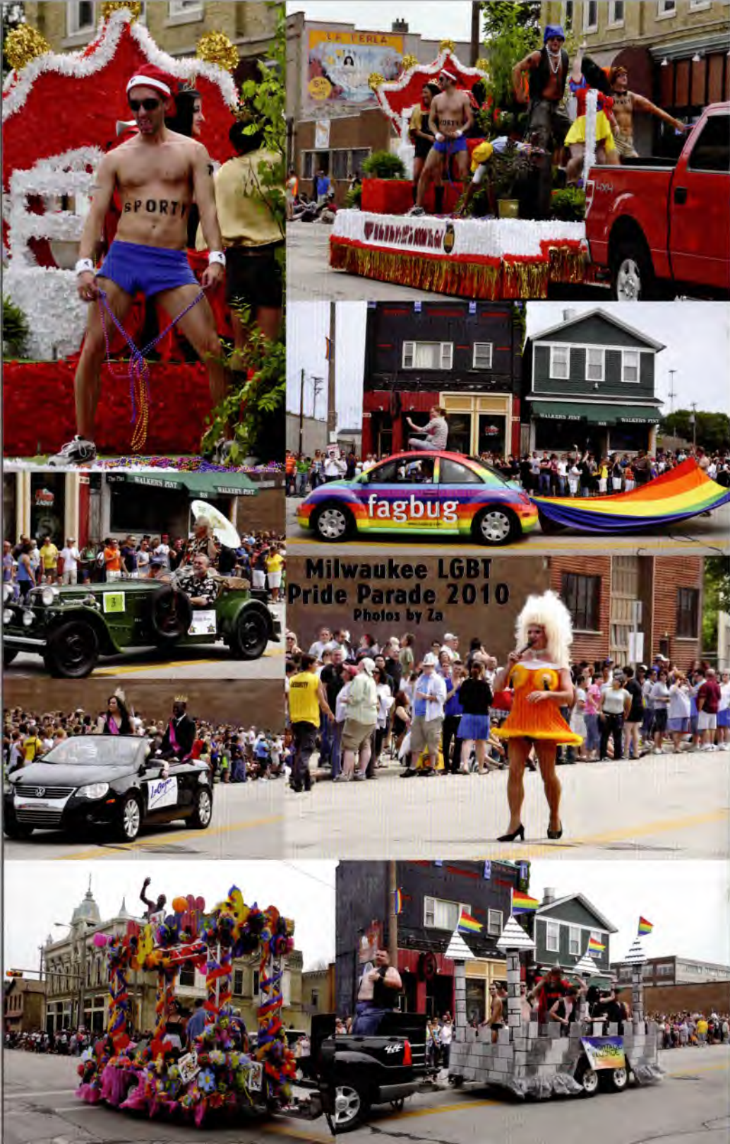
Milwaukee LGBT Pride Parade 2010