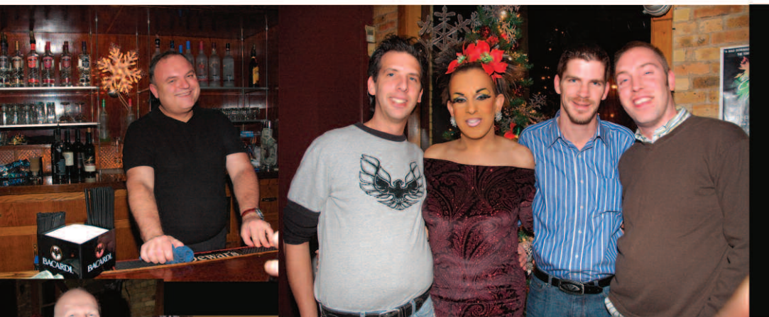
Below: M's Holiday Party