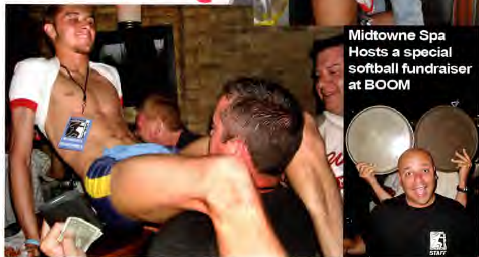
Midtowne Spa Hosts a special softball fundraiser at BOOM