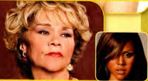
Sunday, June 14, 7PM ETTA JAMES with The Roots Band and Special Guest, DEBORAH COX