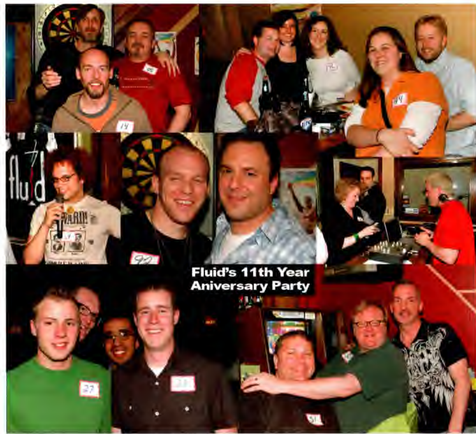
Fluid's 11th Year Anniversary Party

Stop looking. Telling you to stop looking for Prince Charming when that's what you're asking me about seems crazy, but many people find love when they least expect it. Take the pressure off and you're more likely to be yourself...and less likely to settle for the first guy that asks you the time. Go to Pridefest...hit the parade. Just enjoy the week. Give yourself a break and have fun. If Mr. Right is out there, he may just find you!