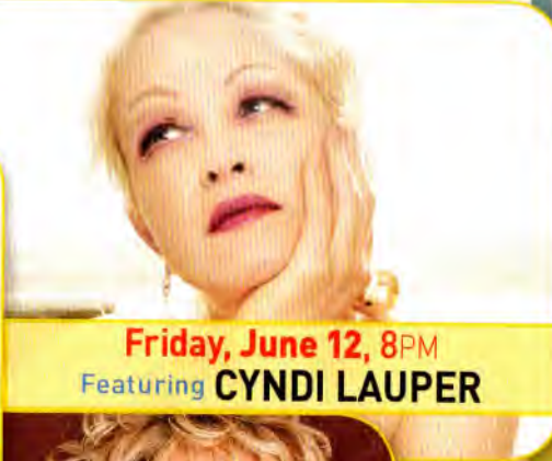
Friday, June 12, 8PM Featuring CYNDI LAUPER