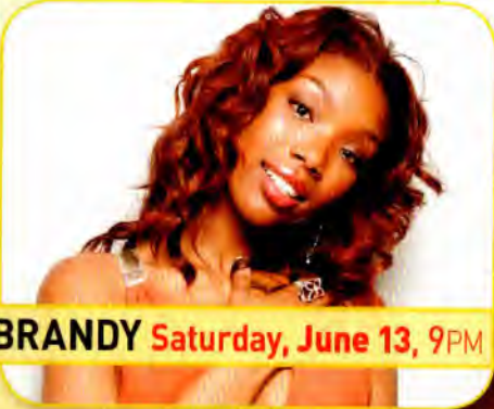
BRANDY Saturday, June 13, 9PM