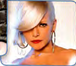
Sunday June 14, 10PM Direct from Europe: SEPTEMBER

A weekend full of non-stop entertainment, friends, food, merchandise, music, exhibits, dance, info, activities, family fun, and PRIDE! Log on to www.pridefest.com for • Volunteer applications • Proud Crowd VIP info • Full entertainment lineup • Ticket purchasing • Festival information Be sure to find PrideFest on Facebook, MySpace and Twitter!