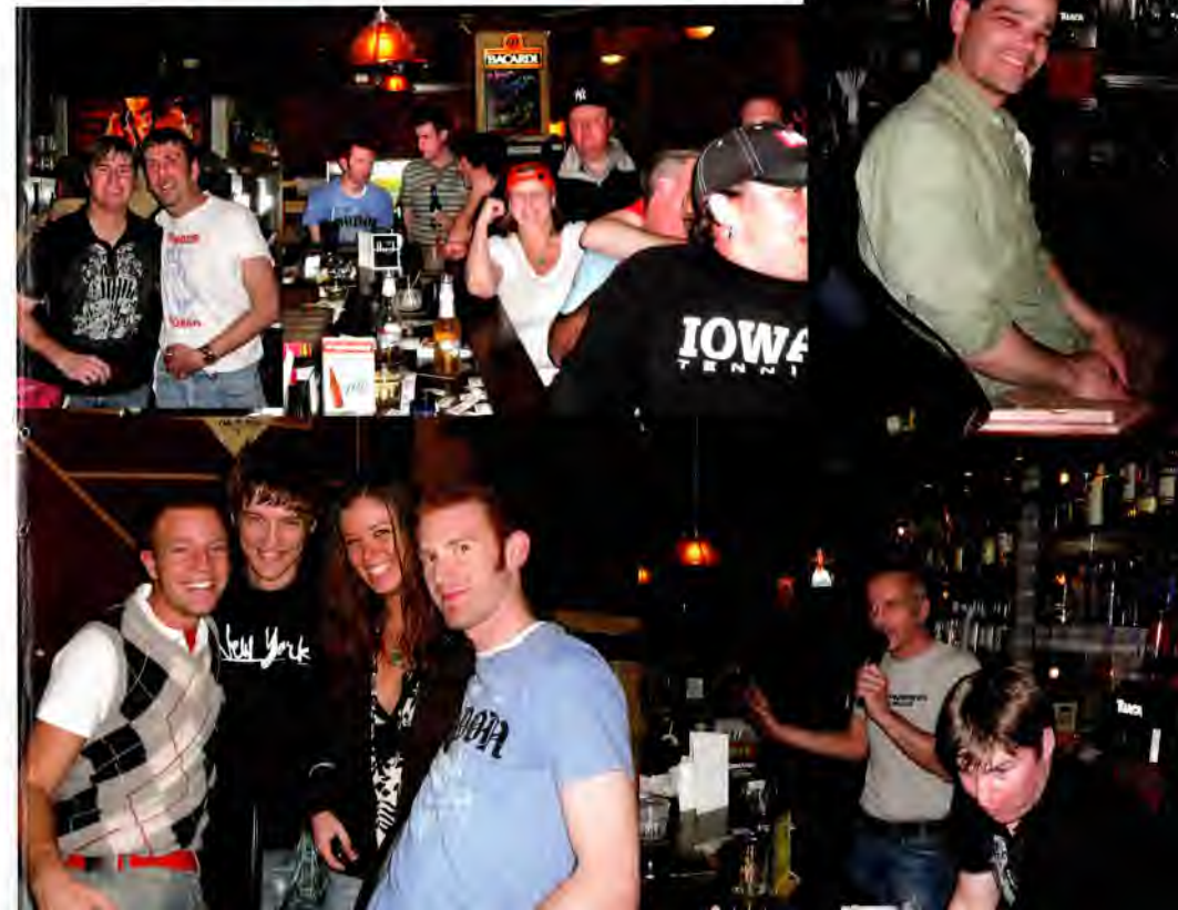
Below: Fluid Anniversary Party

OutBound Magazine P.O. Box 1961 Green Bay, WI 54305 800-578-3785 920-655-0611 email:editor@quest-online.com Publisher: Mark Mariucci, Za's Publications: OutBound & Quest