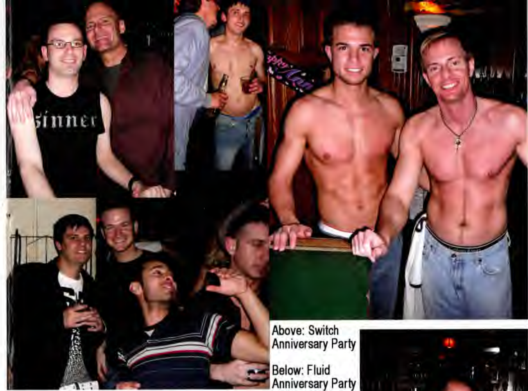
Above: Switch Anniversary Party

Have a joyous Pride time of it this month, Dear Readers. After all it is the glamour not the grammar as I look forward to once again being STILL Cordially Yours, next time.