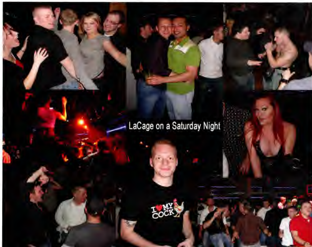
LaCage on a Saturday Night

5665 S. 108th Street • Hales Corners (414)529-2800 cell (414)430-3544 wklaus8163@aol.com